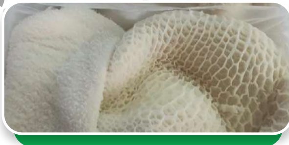
BEEF TRIP 白牛肚