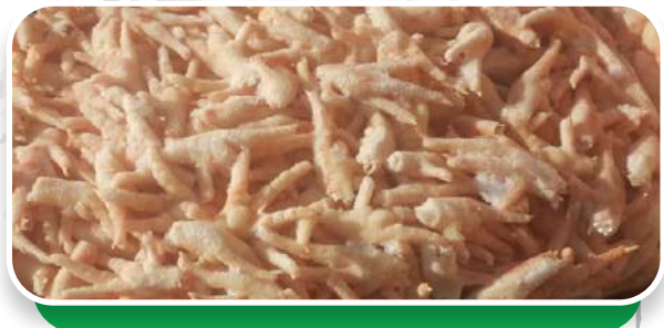
CHICKEN PAWS 凤爪