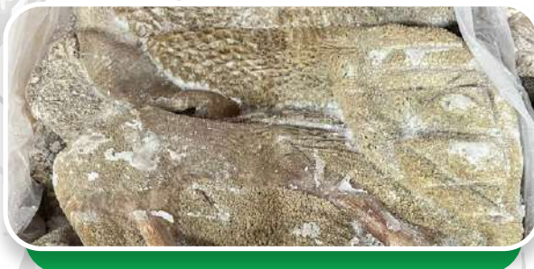
BEEF TRIPE 牛大肚