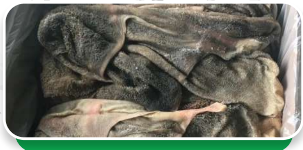
SALTED BEEF TRIPE 盐牛肚