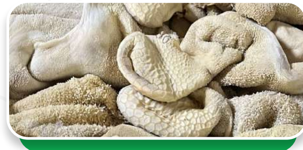
SHEEP TRIPE 熟羊肚