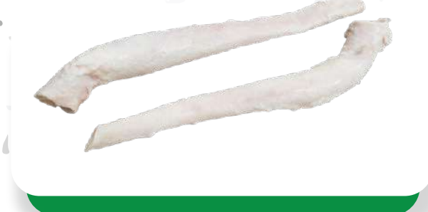
DRY AORT 干主动脉