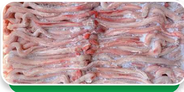
SHEEP PIZZLE 羊鞭