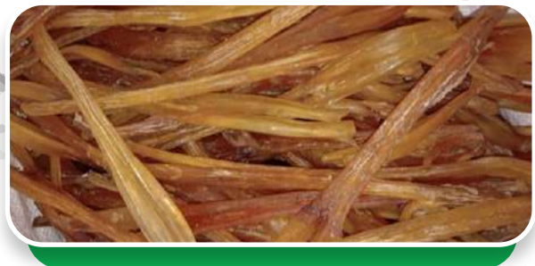
DRY TENDON 干蹄筋